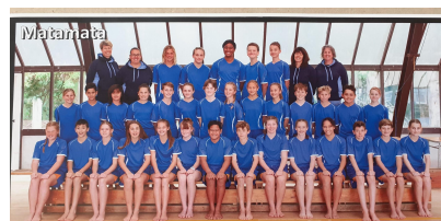
Winners in: Softball, Boys Volleyball, Girls Indoor Hockey, Petanque, Swimming, Scramball, Quality Living, Girls Hockey Runners up in: Rugby, Touch, Frisbee Golf, Wall Ball